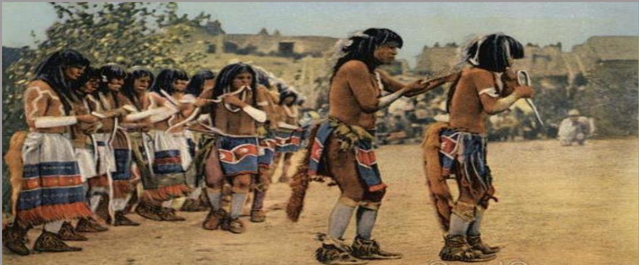
HOPI SNAKE DANCE

In spring, the rituals of the planting are followed by the ceremonies for germination and growth. In summer, the rites of protection of the crops coincide with the ceremonies to invoke rain. The autumn is filled with dances of thanksgiving as the gathering of the harvest evokes prayers for the fertility of the earth for the coming year. There are many other ceremonies throughout the year like the famous Dances with Snakes , where members of the Snake and Antelope clans perform this ritual and the participants do not wear masks.