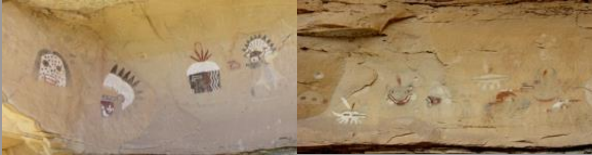
VILLAGE OF THE GREAT KIVAS - ZUNI, NM